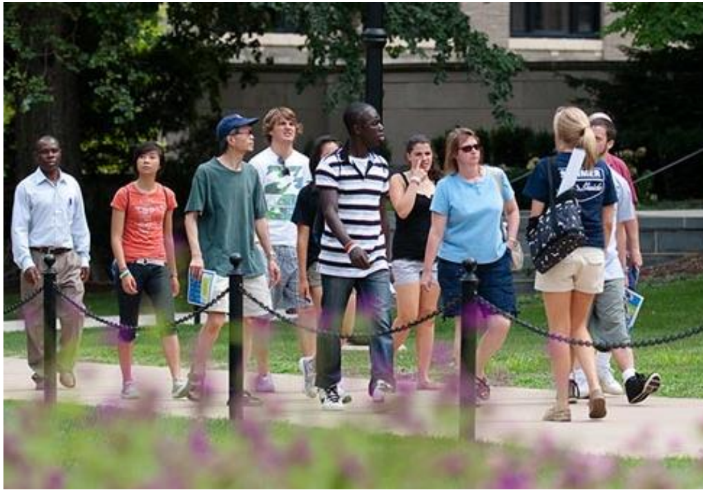
CAMPUS VISITS – WHEN TO GO AND WHAT TO ASK